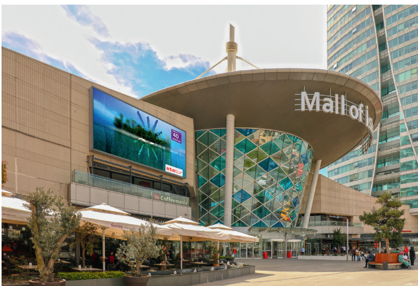
MALL OF ISTANBUL ISTANBUL / TURKEY