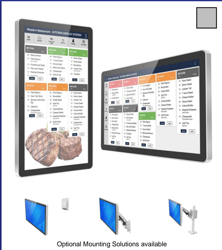
Optional Mounting Solutions available